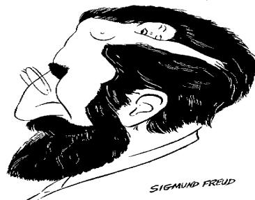
WHAT'S ON A MAN'S MIND

It's all about angles and vantage points. You don't like what you're seeing, change the angle of your outlook and you will be treated to something which, though the same, is completely different. Consider Freud's famous What's on a Man's Mind illustration. Look one way at this image and you see the profile of a man. Look another way and you see a nude lady. Same object, but a different experience depending on how you choose to look at it.